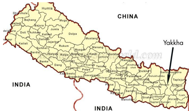
Figure 1: Yakkha speaking area

Sino-Tibetan > Tibeto-Burman > Kiranti > Eastern Kiranti. Spoken in Eastern Nepal, in Sankhuwasabha and Dhankuta districts. 14000 speakers (population: 17000), abandoned by younger generation.